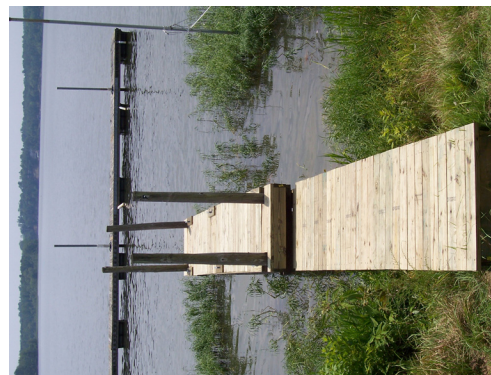
Newly renovated finger pier.